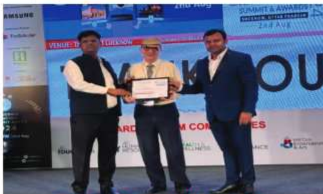
(Receiving Certificate of Appreciation in Education Leadership Summit)